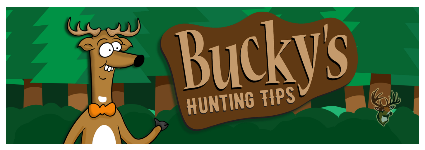
Tip #1: Finding Sheds in Bedding Areas

Whitetail deer drop their antlers once a year, usually in late winter and right around February.